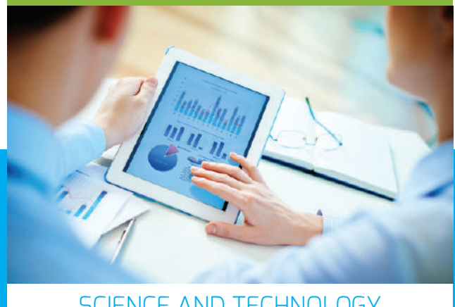
SCIENCE AND TECHNOLOGY

From its beginning the SPI Group has understood the importance of innovation in a dynamic and challenging